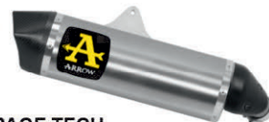
MAXI RACE-TECH CARBON END CAP