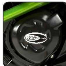
ENGINE CASE COVERS