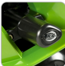
AERO CRASH PROTECTORS