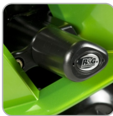
AERO CRASH PROTECTORS