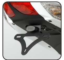
TAIL TIDIES Plus much more...