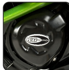
ENGINE CASE COVERS