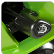
AERO CRASH PROTECTORS